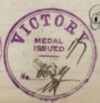
National Archives of Australia: B2455, MCINTYRE C D, page30